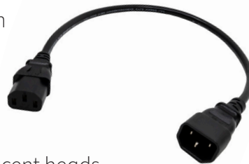
Adapter to connect the PL2 light head to old dock arms (DL2-ADPT)