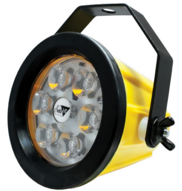
Adapter to connect the PL2 light head to old dock arms (DL2-ADPT)