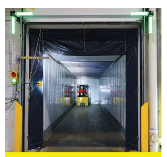
Pair the DL2GN with our DL2IL to maximize safety and productivity!