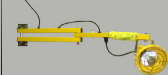
Double Strut Flex Arm

The FLDDL series dock loading light combines the strength of a standard dock light arm with the added flexibility of a impact absorber to create an incredibly durable product. The FLDDL will withstand blows from fork lift trucks and dock doors. Available in 40", 60" or 90" arm lengths.