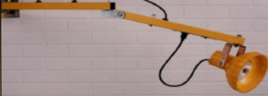
Single Swing Arm

The SDL series is an economical lighting solution for low to mid volume loading docks. The arm features a hinge that allows both vertical and horizontal adjustment of the arm's second section. This arm is available in 40" or 60" lengths.