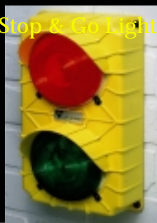
Stop & Go Lights