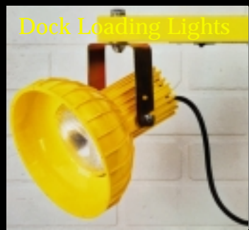
Dock Loading Lights