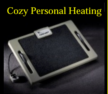
Cozy Personal Heating